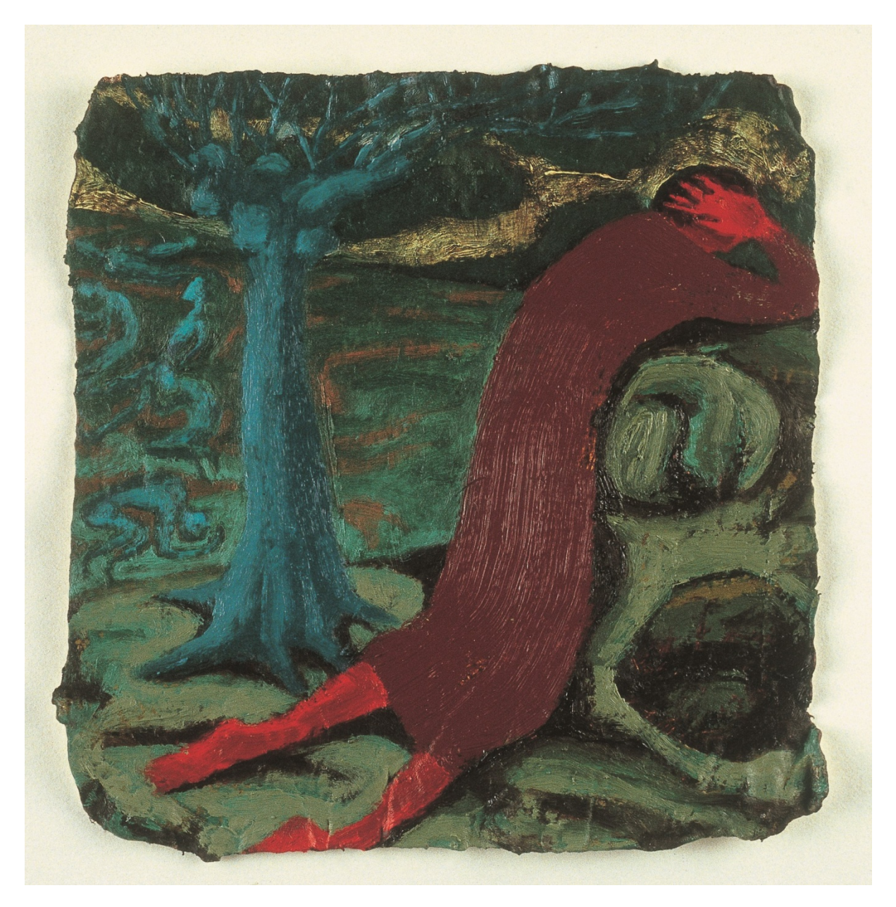
MARK CAZALET ' Fool of God (Christ in the Garden) ' from the Methodist Modern Art Collection www.methodist.org.uk/artcollection