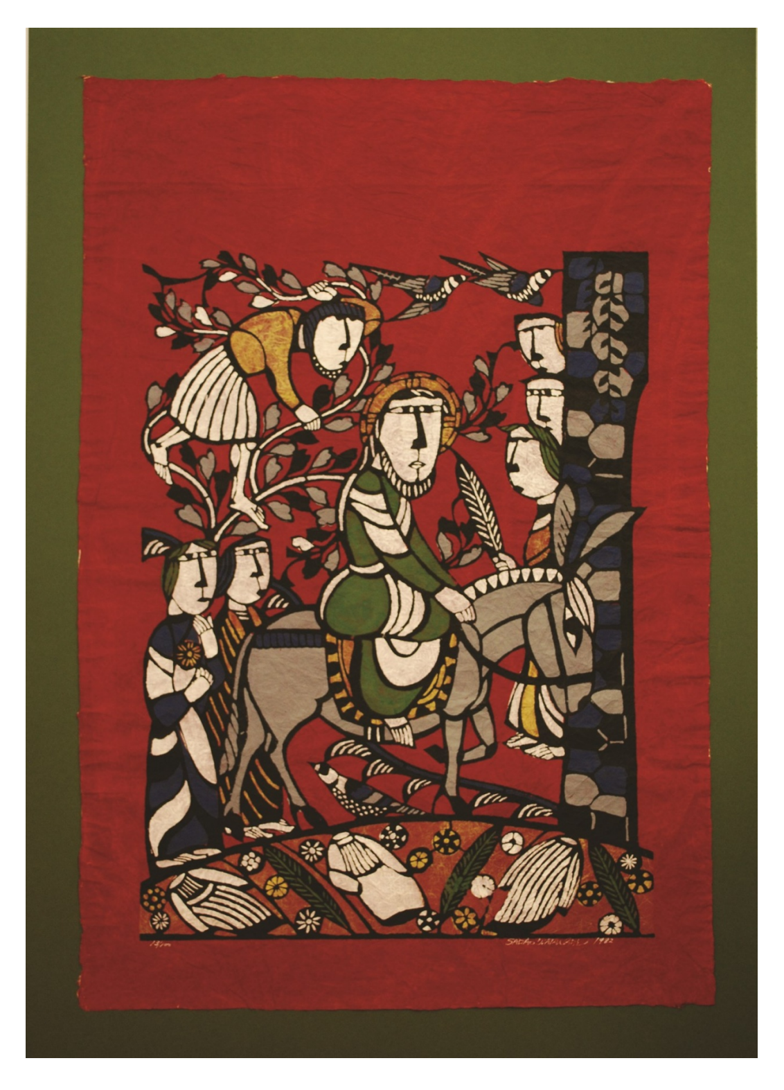
SADAO WATANABE ' Christ enters Jerusalem' from the Methodist Modern Art Collection, © TMCP, used with permission. www.methodist.org.uk/artcollection