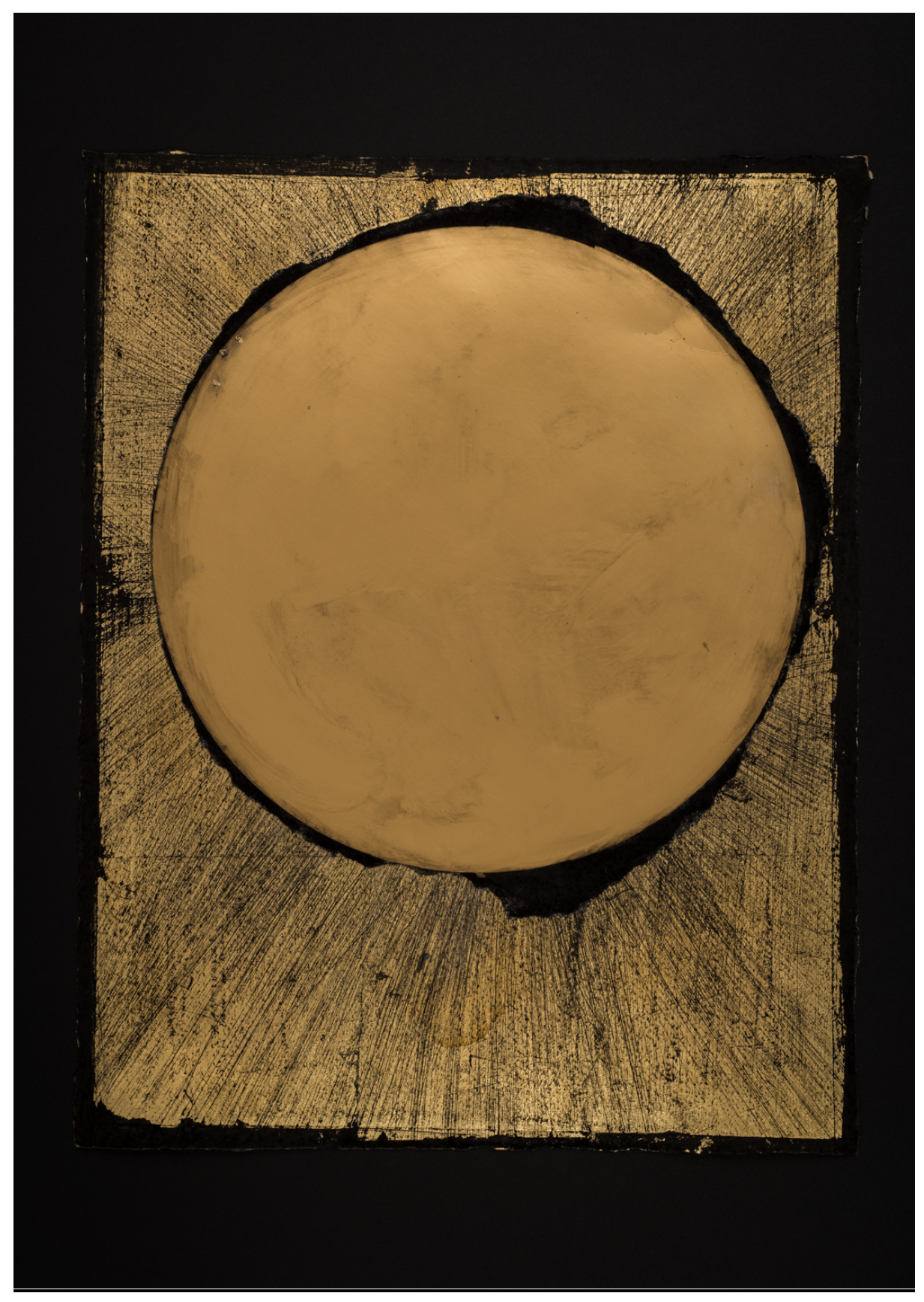
CAROLINE WATERLOW 'Sol Invictus/The Unconquered Son' <a href="http://www.carolinewaterlow.co.uk/">http://www.carolinewaterlow.co.uk/</a>