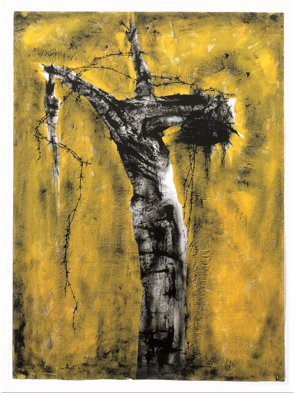
THEYRE LEE-ELLIOTT ' Crucified tree form - the Agony' from the Methodist Modern Art Collection, © TMCP, used with permission. www.methodist.org.uk/artcollection